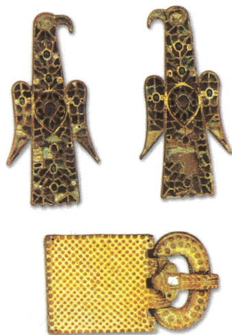
Region • Visigoth artifacts, like these saddle buckles, were found near Rome. ▲

After looting the great city, fierce bands of warriors and bandits have continued raiding towns and villages throughout Western Europe. They are stealing jewels and money, killing both people and animals, and even seizing control of entire territories. The Roman Empire seems to have breathed its last breath.